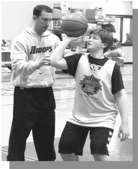
Our Location Backcourt Hoops at Riverfront Sports